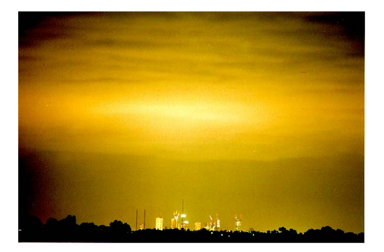
Figure 2. Melbourne's skyglow in 1990 as seen from Eltham, 20 km from the city centre, at midnight with the moon below the horizon.

Curves like that in Figure 1 are valuable as evidence to support the imposition of lighting caps and other corrective actions in connection with environmental requirements. The starting point in generating such a curve is preferably the value of natural skyglow before the introduction of electric light, in 1880, say. At least two more points are needed for curve fitting, preferably well separated, and the more the better to overcome the uncertainty caused by night to night variations. It is important to try to include some values derived from star visibility decades ago. Subtract the known luminance of the natural clear moonless night sky (about 0.28 mcd/m<sup>2</sup>, but it varies with the solar cycle) from each data point to get the artificial contribution and fit an exponential curve using a computer spreadsheet. Add 0.28 mcd/m<sup>2</sup> to the curve heights to get total skyglow. The resultant curve is only indicative of the underlying trend and ignores fluctuations from events such as economic depressions and wars, but the typical alarming growth of recent decades will be well shown.