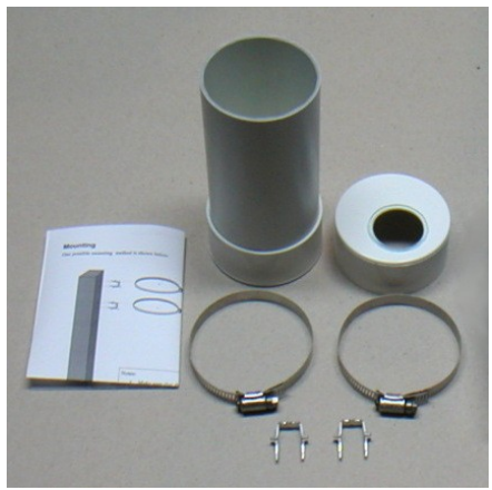
Illustration 3: Housing

http://unihedron.com/projects/sqmhousing/