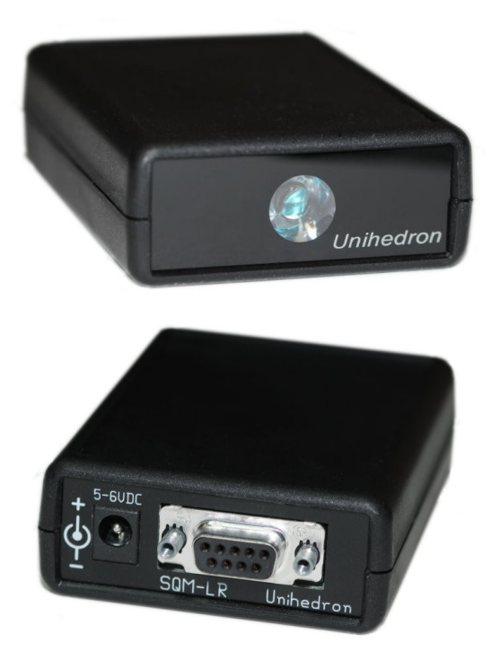
Illustration 2: Unit photo